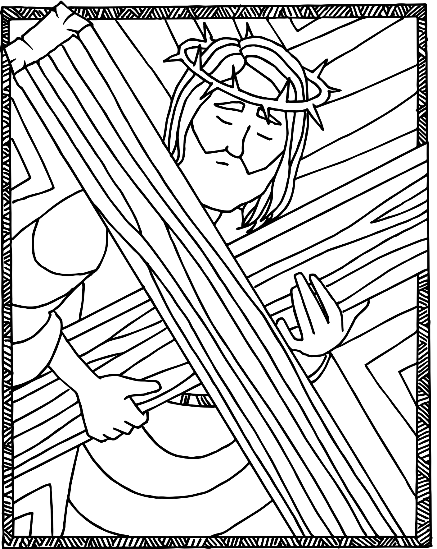
2. Jesus Takes His Cross