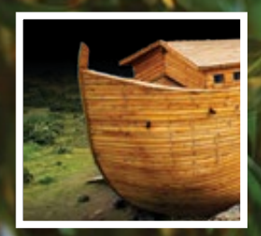
DAY 8 8 Faithful Family Members