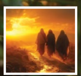
DAY 7 7 Miles ... Walking With Jesus